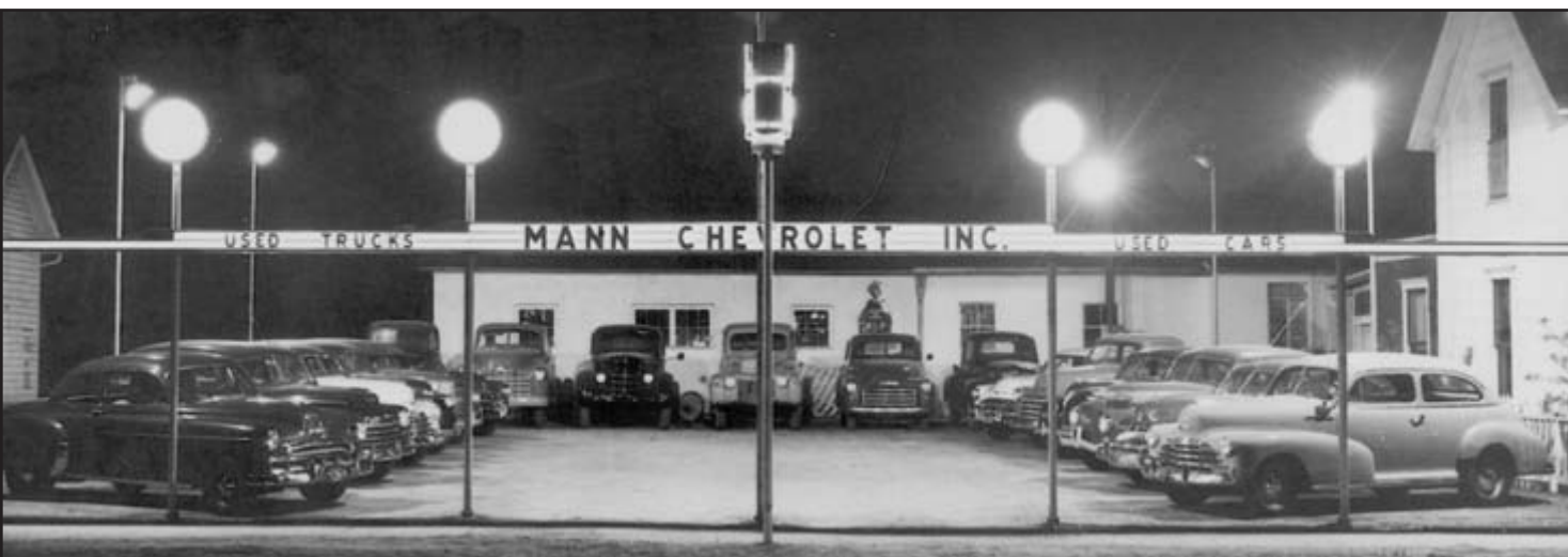
A fine selection of cars and trucks can be seen in the Mann Chevrolet lot in the 1950s. This is still Mann's car lot today.