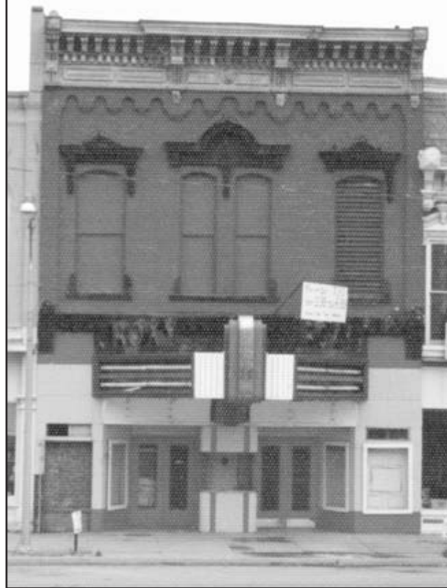
The Roxy Theatre was located on the north side of the courthouse square on Franklin St. in Delphi.