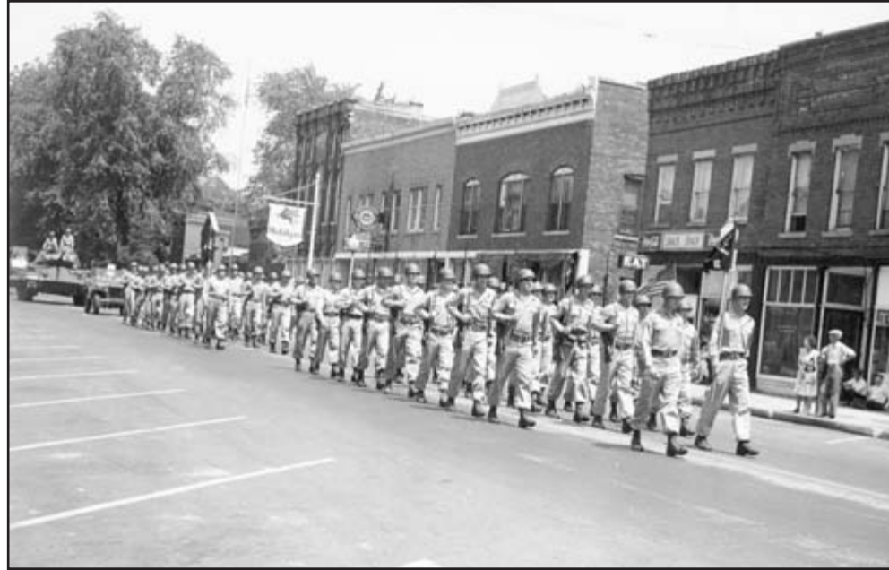
A crowd observes the National Guard Unit, Company B, 293rd Infantry, marching down Main St. in Delphi during the Fourth of July parade in 1950.