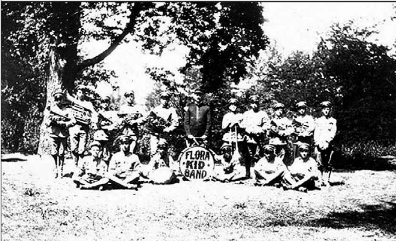
Flora Kid Band, 1905

From the files of Hoosier Democrat, Delphi Journal, Journal-Citizen and Carroll County Comet.