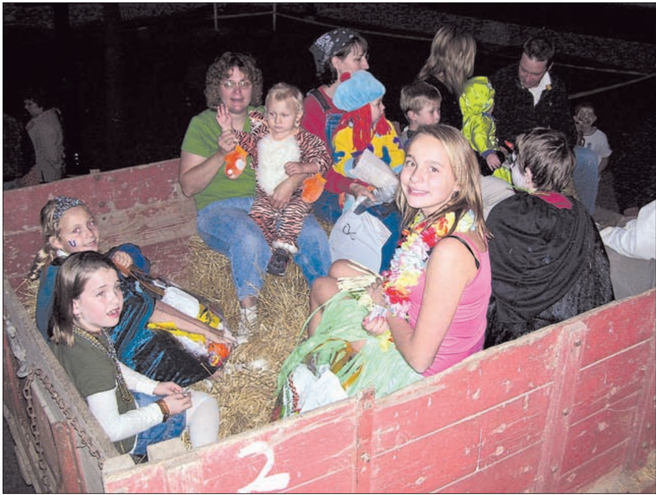
Delphi United Methodist Church had a Fall Carnival, with games, hot dogs and treats, Oct. 31 at Canal Park. The Canal Association provided hayrides and trolley rides, and the Delphi Chamber of Commerce organized a pumpkin patch, with prizes. Around 500 children attended the event throughout the evening.