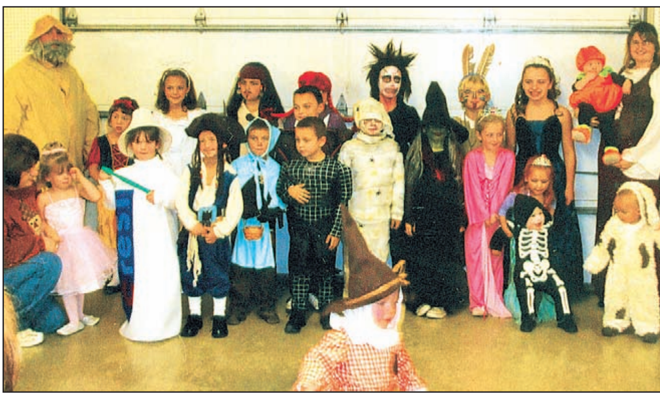
Lions' Halloween Fest The annual Halloween Fest, sponsored by Flora Lions Club, includes a chili supper and costume judging. Contestants of all ages are judged for the most original, prettiest, and scariest costumes. Some of this year's contenders are pictured above.