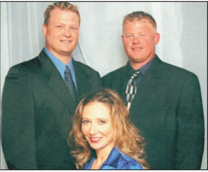
The Eternals will present a concert June 29 at Camden First Baptist Church