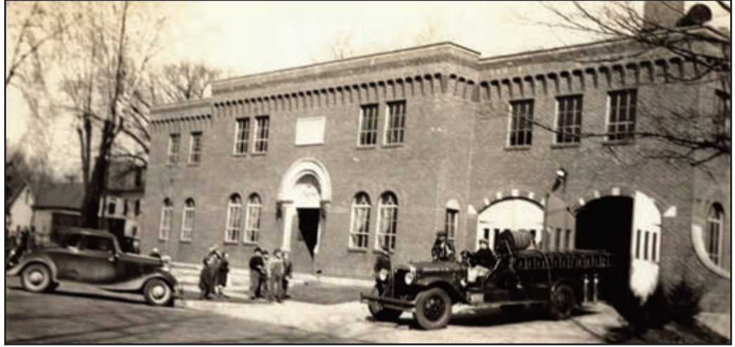
Delphi Armory, City Hall, Fire Station, 1937

From the files of Hoosier Democrat, Delphi Journal, Journal-Citizen and Carroll County Comet.