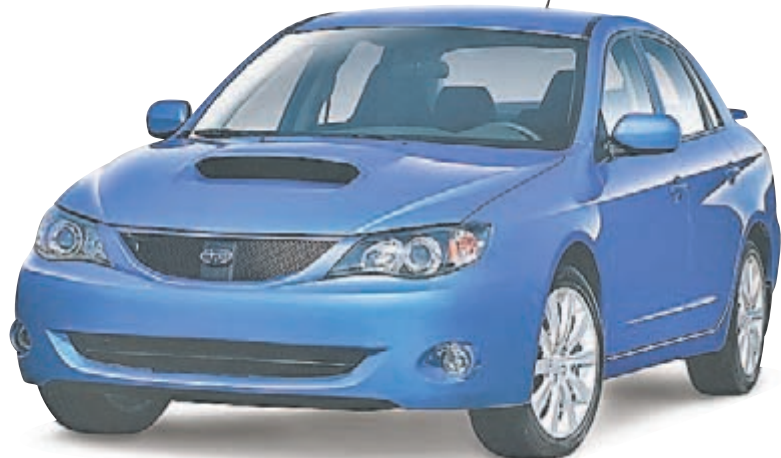
2008 IMPREZA WRX