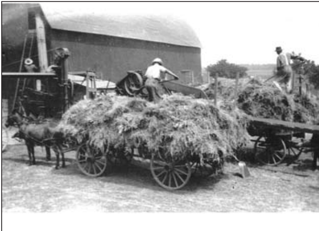
Thrashing grain on Anderson farm, Carroll County, 1930

From the files of Hoosier Democrat, Delphi Journal, Journal-Citizen and Carroll County Comet.