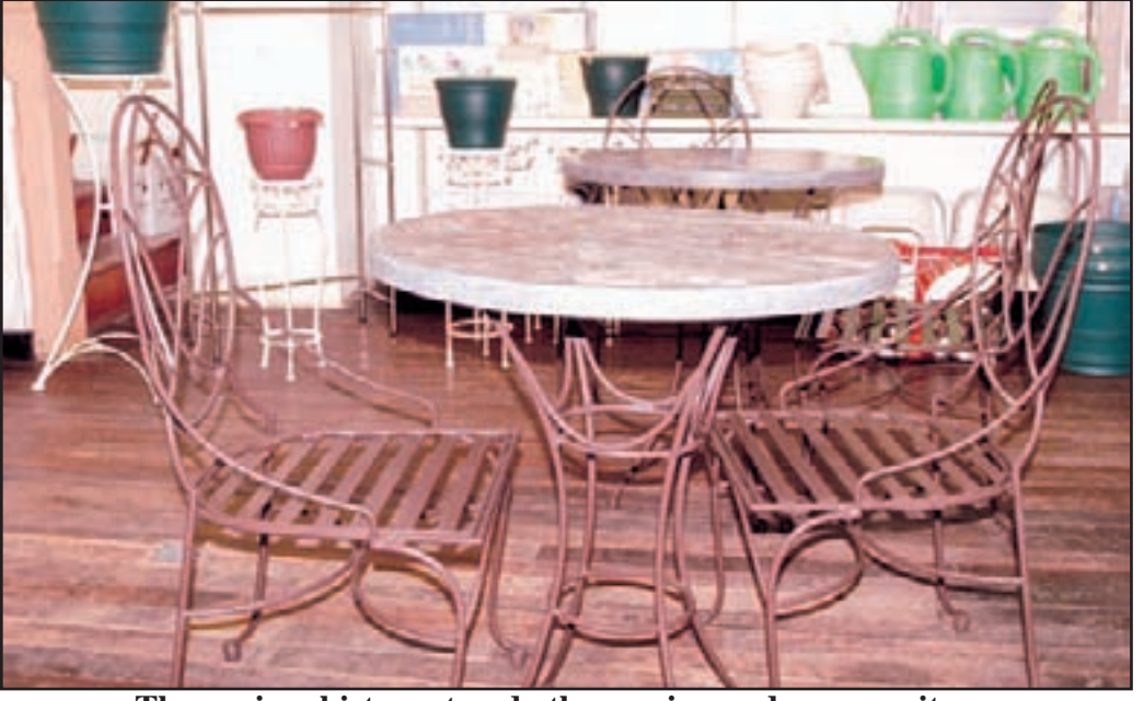
Three-piece bistro set and other spring and summer items are offered at Sandy's Variety Mart

Dr. Thayer's Nutrition Center 10% Off VITAMIN SALE With coupon 9 N. Earl Ave., Lafayette Mar-Jean Village 765-447-0163