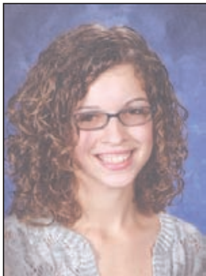
Her grade point average is 10.41.

Her academic achievements are for Academic Excellence; Top Girl Student; Presidents Education Award; Top Student for science, social studies, and English; Star Program; Perfect Attendance; Honor Society; Hall of Fame award in track, volleyball and Special Recognition for volleyball.