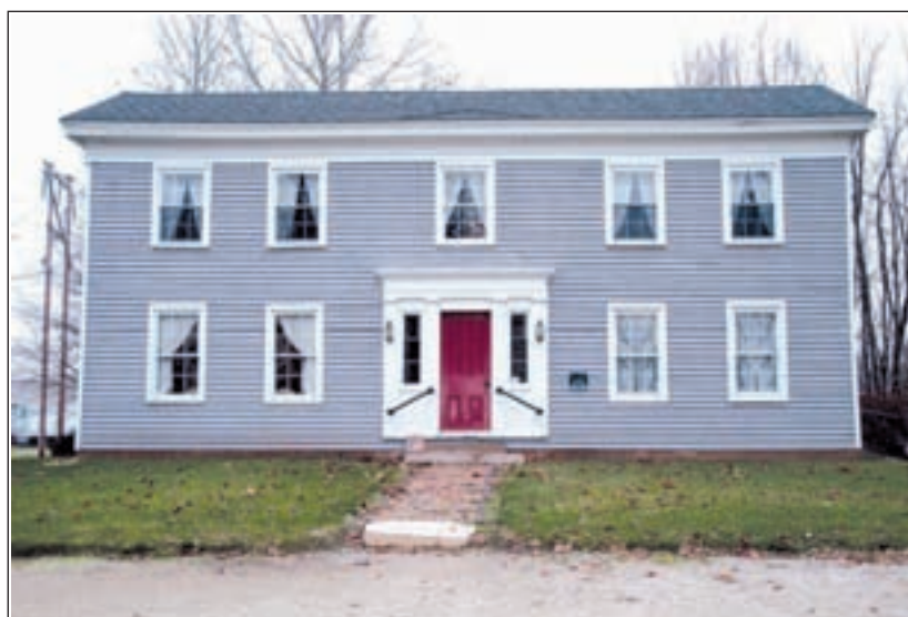
Reed Case House – before and after The top photo shows the Case House as it appeared in the 1980s, before renovation. The other photo was taken by the Comet this week. The 1844 house has been restored as much as possible to its original state.

Entry hall The first-floor hall and staircase have changed dramatically since the Case House was first acquired. After layers of paint were removed, walnut railings emerged. Artist Terry Lacy recreated the faux marble wall treatment. Current photo by Jennifer Archibald