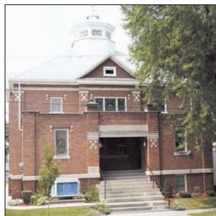
Flora Presbyterian Church - 2006

Flora's Channel 2 will be taping Sunday's celebration. It will be aired on Monday night.