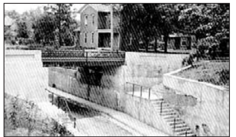
Viaduct over S. Washington St., Delphi, 1915