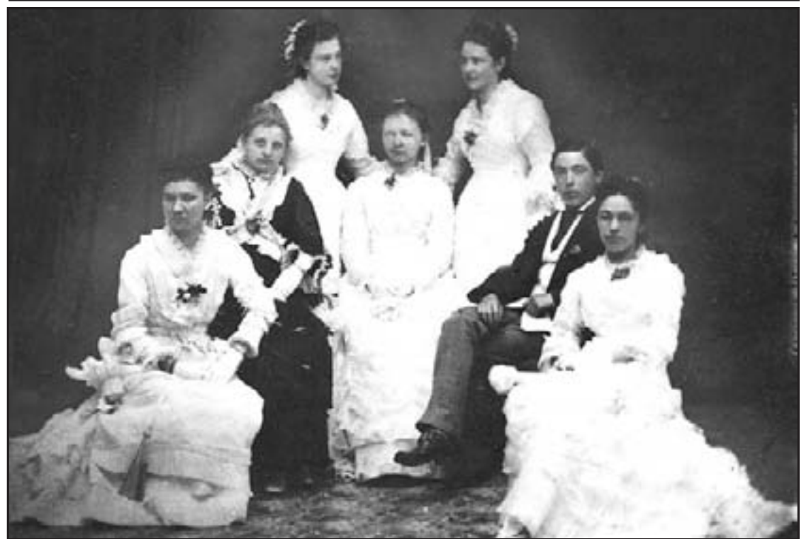
Delphi H.S. graduating class, 1878

From the files of Hoosier Democrat, Delphi Journal, Journal-Citizen and Carroll County Comet.