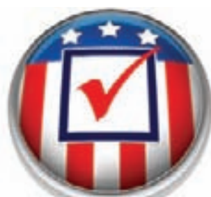
Carroll County Primary Election School Board Race

Both candidates said they have been keeping up with what's happening at school board meetings by reading the official minutes on the corporation Web site and/or reading newspaper coverage of the meetings.