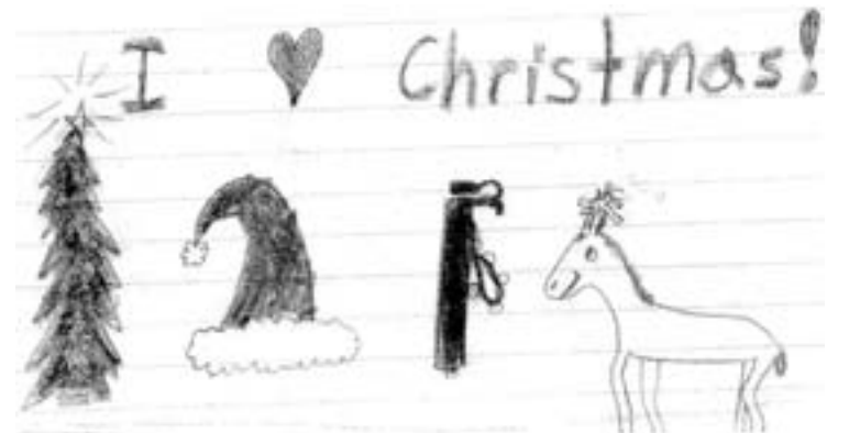
Drawing by Kate